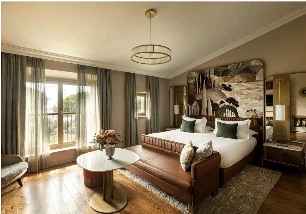
A junior suite at Castelfalci. CASTELFALFI

The only experience at Castelfalci that is not inspired by the destination is the newly renovated 16,000-square-foot RAKxa Wellness Spa, created in collaboration with coveted Thai wellness brand RAKxa. The Bangkok-based retreat center worked with Castelfalci to create three exclusive massage treatments. The ‘Good Night Sleep’ massage incorporates singing bowls and works with the body’s energy points to facilitate deeper slumbers; the ‘Tension Release’ combines Thai massage techniques with stretching to remove blockages along the body’s meridian lines and improve circulation; and the ‘Seven Chakra Hot Stone Massage’ aims to restore harmony to the body using warm natural stones and crystals.