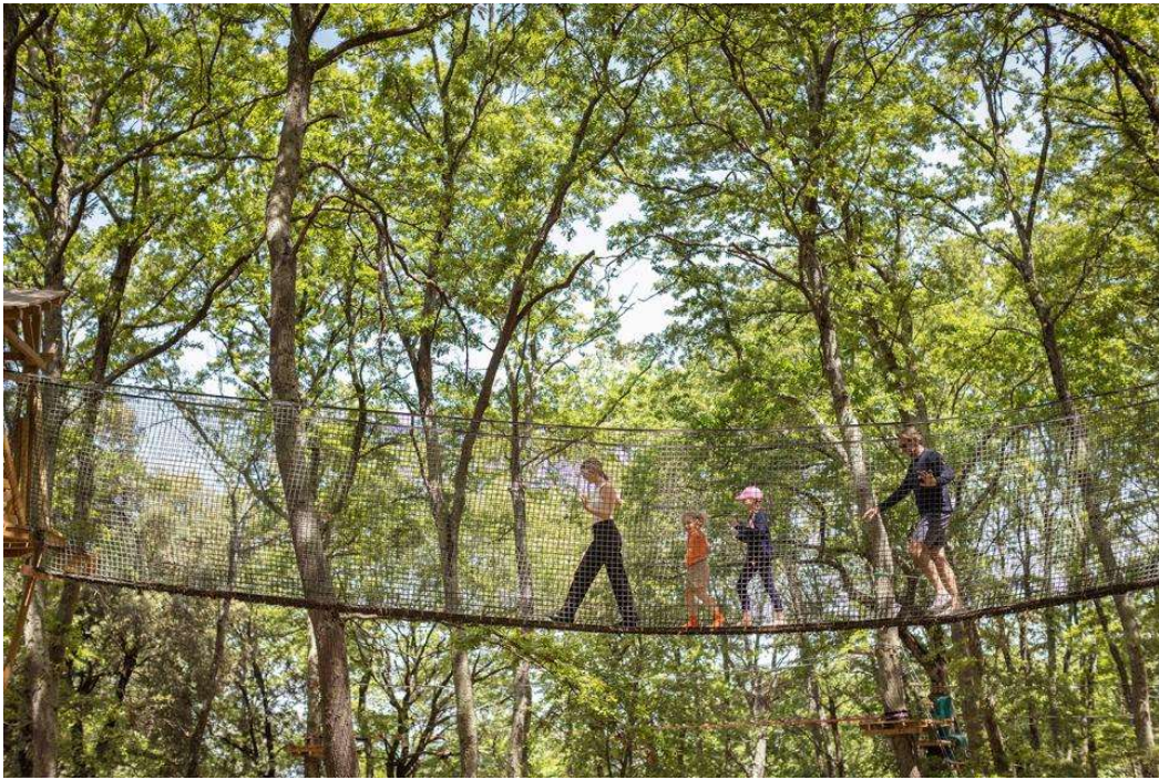
Castelfalfi's adventure park offers ziplining and survival courses. CASTELFALFI

Passport: Explore the finest destinations and experiences around the world in the Forbes Passport newsletter.