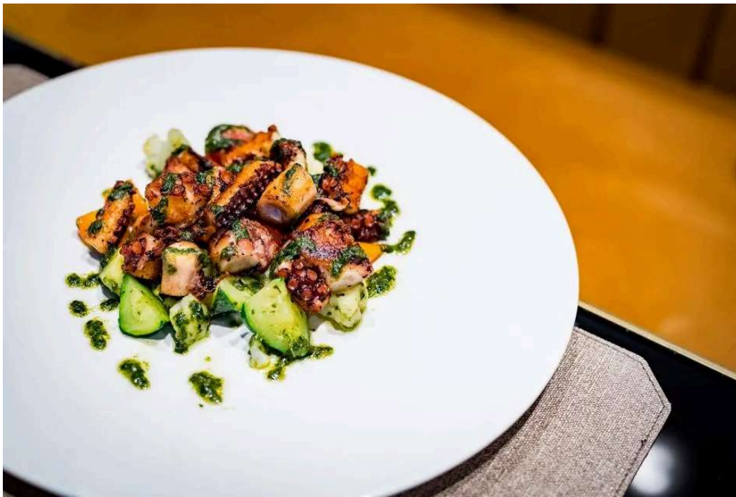
Castelfalfi's five dining concepts source ingredients from the bounty of the estate.

Beyond the Thai-influenced treatments, the spa offers a wide variety of facial, body and beauty treatments, many of which incorporate essential oils and indigenous herbs sourced from the surrounding landscape. Guests seeking warmth during the chillier shoulder season will appreciate the heated indoor-outdoor pool, two saunas, Turkish bath and sensory showers.