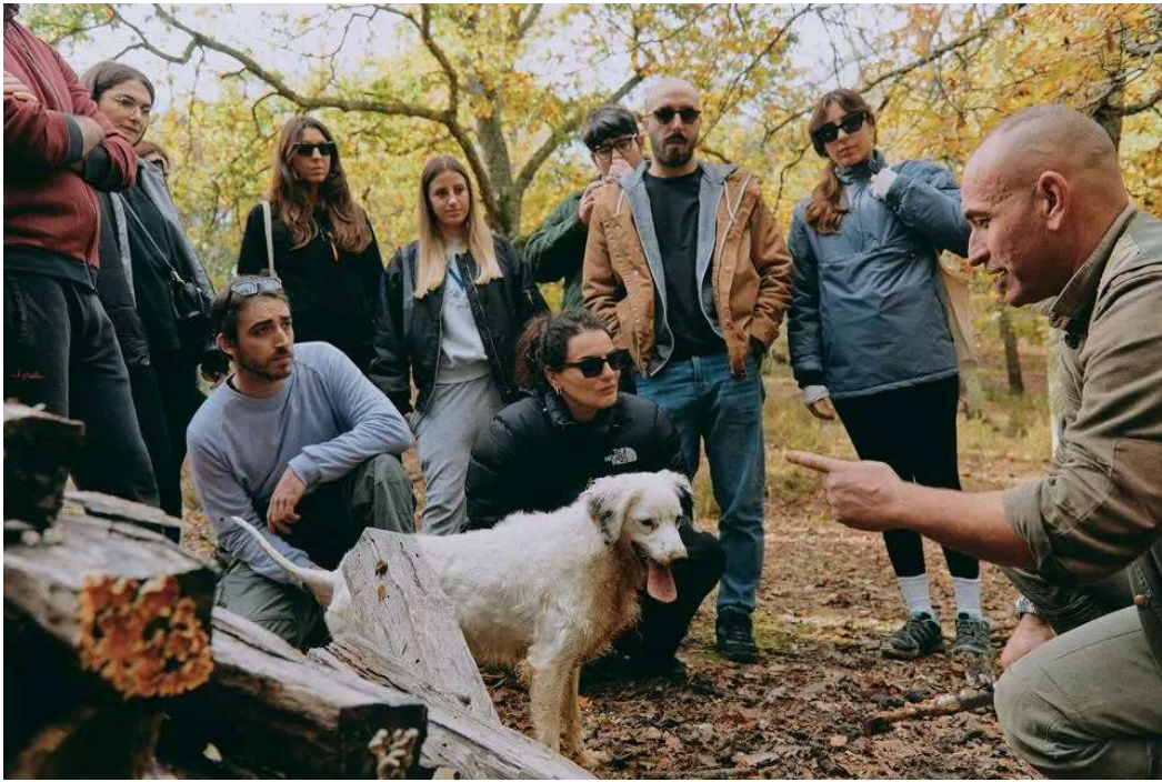
The shoulder season is the best time for truffle hunting with a Castelfalfi guide.