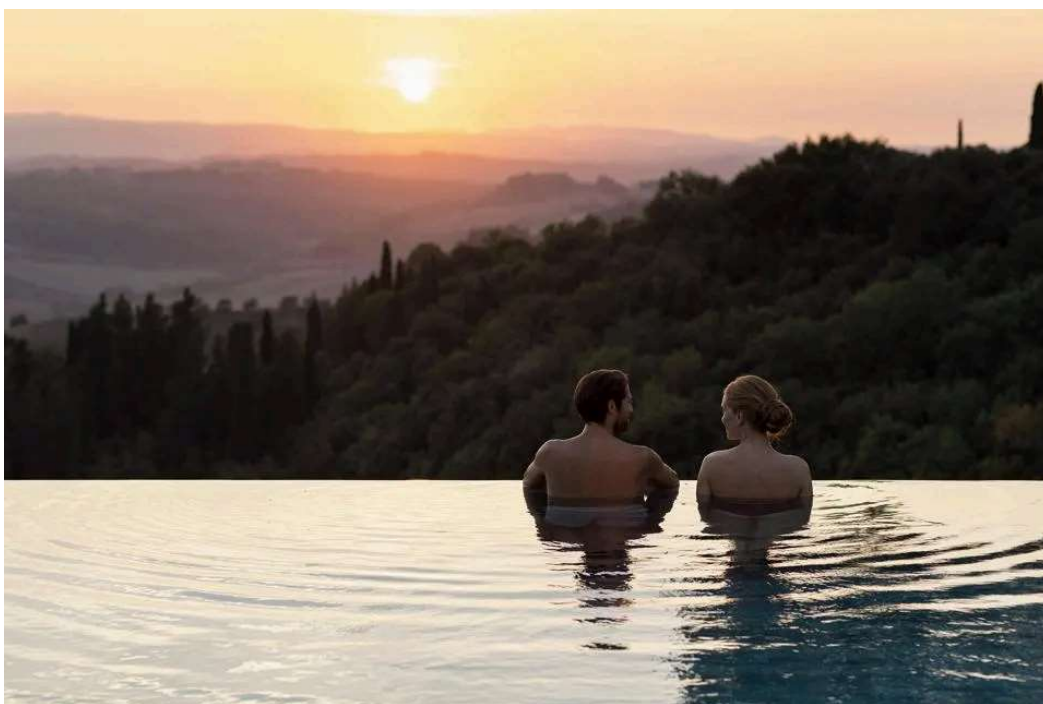
Castelfalfi indoor-outdoor pool is heated and open year-round. CASTELFALFI

Beyond the Thai-influenced treatments, the spa offers a wide variety of facial, body and beauty treatments, many of which incorporate essential oils and indigenous herbs sourced from the surrounding landscape. Guests seeking warmth during the chillier shoulder season will appreciate the heated indoor-outdoor pool, two saunas, Turkish bath and sensory showers.