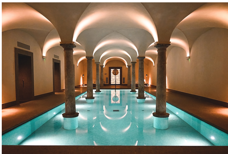
The Longevity Spa, Portrait Milano in Milan, Italy. 8. The Longevity Spa, Portrait Milano | Milan, Italy

A daring avant-garde realm defying the limits of age itself, the Longevity Spa is the pièce de résistance of Portrait Milano. Enconced within architect Michele De Lucchi's meticulous restoration of a 1564 Archiepiscopal Seminary, this 7,500-square-foot domain alchemizes the building's Renaissance Revival soul with pioneering biohacking science. The design brilliantly merges past and future: beneath the seminary's towering vaulted ceilings, an atmosphere of tranquility reigns, with a showstopping pool and wet areas setting the tone for optimized rejuvenation through bespoke high-tech regimens. The Ferragamo family and their Longevity Suite collaborators have manifested a future-forward space that metabolizes cutting-edge technologies, regimens inspired by the world's Blue Zones, and a holistic philosophy of prospering through science-infused natural balance.