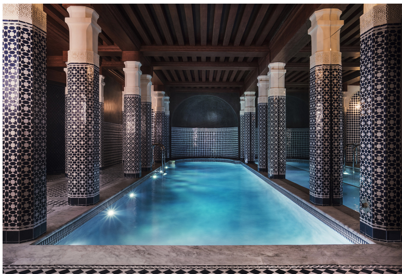
Maison Proust in Paris, France.

immersion into hydrothermal wisdom, where invigorating frigidarium plunges and the sunken, metabolism-stimulating heat of the caldarium ignite profound healing.