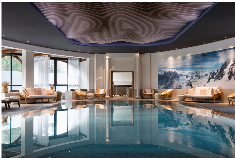
Evian Spa, Hôtel Royal in Evian-les-Bains, France. Photo: Hôtel Royal 12. Evian Spa, Hôtel Royal | Evian-les-Bains, France

Nestled within Evian's idyllic spring-fed terrain, the spa at Lake Geneva's Hôtel Royal is a tribute to the local alpine flora and the mineral-laden rock formations that endow Evian with its legendary healing waters. As Europe's first Evian-branded Spa, sprawling an impressive 18,299 square feet, it has emerged from meticulous renovations to become the continent's premier hydrothermal retreat, with every design and sensory detail harmoniously aligned with the water cycle's four foundational stages: celestial birth, mineral infiltration, precious reserves, and vitalizing spring. Each space immerses guests in water's rhythmic and rejuvenating properties from the six individual and two couples' treatment rooms framing Alpine panoramas to the communal wet areas with their hydro-circuits, snow rooms, saunas, and adjoined pools.