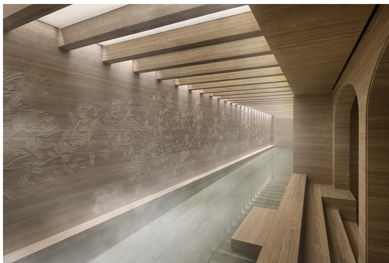
The Six Senses Spa, Six Senses Rome in Rome, Italy.

Journey through to unveil how the dreamiest new spas of today transcends the ordinary, becoming gateways to enriched harmony, profound connection, and radiant beauty.