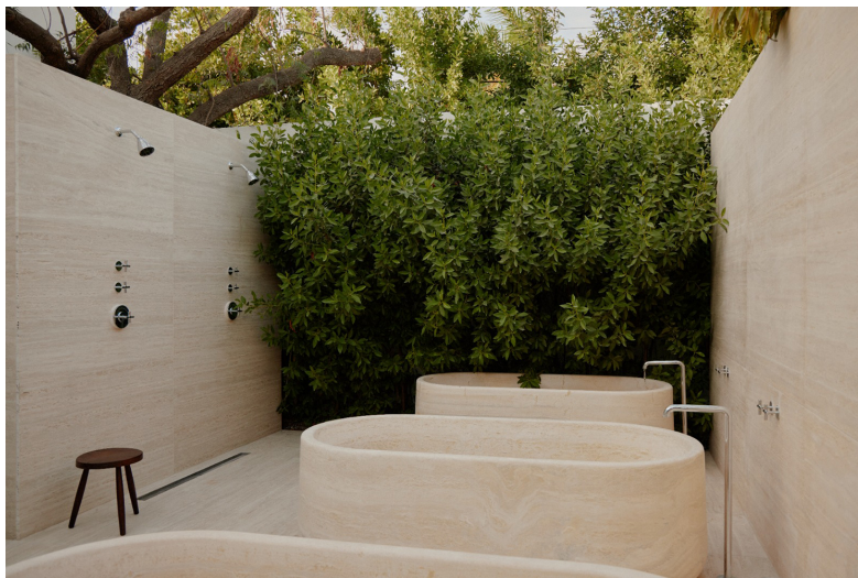
The Garden Club at Palm Heights in Grand Cayman. Photo: palm Heights 2. The Garden Club At Palm Heights | Seven Mile Beach, Grand Cayman

The Garden Club at celebrity hotspot Palm Heights transcends the notion of a mere “hotel amenity”—this 60,000-square-foot Xanadu is a shrine to hedonistic rejuvenation majestically set upon Grand Cayman’s Seven Mile Beach. Architect Dong Ping Wong has conceived a living sanctuary where clusia hedges double as decorative barriers and verdant portals into hidden alcoves. Every element is an earth-conscious choice, from the pampering rituals featuring cult-favorite brands like Costa Brazil to the moonlit open-air ceremonies under starry canopies. Simply put, eco-chic as a baptismal covenant is woven into the Garden Club’s ascetic DNA and exceedingly sensual architecture.