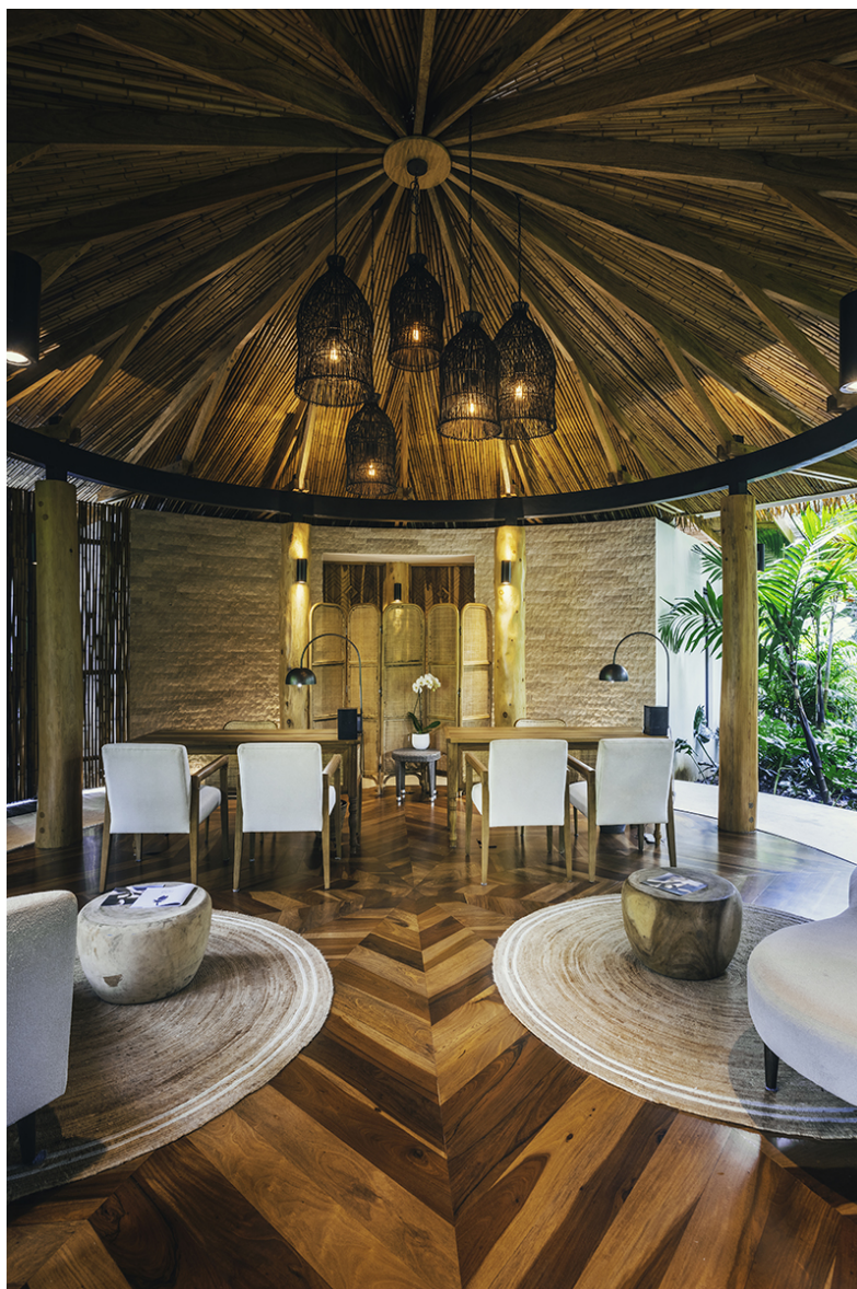
Nayara Tented Camp in La Fortuna, Costa Rica. 9. Sukha Spa at Nayara Tented Camp | La Fortuna, Costa Rica

Nayara Tented Camp has unveiled Sukha Spa, a sylvan sanctum suspended opposite Costa Rica's Arenal Volcano. This immersive wellness escape transports guests into nature through three-day personalized pathways. From the creek-side treatment villas with private plunge pools to cherished volcanic mud rituals, every facet awakens the senses and attunes the spirit to the region's biophilic essence. After therapies inspired by local healing arts, the fully-equipped gym invites further empowerment, with volcanic views providing the ultimate inspiration for fitness journeys. A love letter to "pura vida", this sustainable, soul-nurturing oasis manifests the transformative power of uniting with the great outdoors.