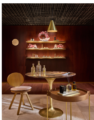
Asaya Spa By Guerlain, Rosewood São Paulo.

Among the splendor of Tuscany's vineyards, a groundbreaking wellness synergy has taken root at Castelfalfi resort's RAKxa Spa. Marking the Thai brand's European debut, RAKxa was unveiled in March 2024 as part of a multi-million-dollar renovation by Affine Design. The French design team skillfully intertwined ancient healing traditions with contemporary comforts, creating a sanctuary of earthy tones, natural materials, and seven treatment rooms. The spa also boasts saunas, steam rooms, and a stunning heated infinity pool that offers breathtaking views of the Tuscan landscape. In partnership with legacy brands like ESPA and Maria Galland Paris, the RAKxa experience introduces exclusive integrative rituals rooted in Thai, Chinese, Ayurvedic and energy healing philosophies.