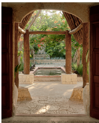
Maroma Spa By Guerlain, Maroma, A Belmond Hotel in Riviera Maya, Mexico.

The Garden Club at celebrity hotspot Palm Heights transcends the notion of a mere “hotel amenity”—this 60,000-square-foot Xanadu is a shrine to hedonistic rejuvenation majestically set upon Grand Cayman’s Seven Mile Beach. Architect Dong Ping Wong has conceived a living sanctuary where clusia hedges double as decorative barriers and verdant portals into hidden alcoves. Every element is an earth-conscious choice, from the pampering rituals featuring cult-favorite brands like Costa Brazil to the moonlit open-air ceremonies under starry canopies. Simply put, eco-chic as a baptismal covenant is woven into the Garden Club’s ascetic DNA and exceedingly sensual architecture.