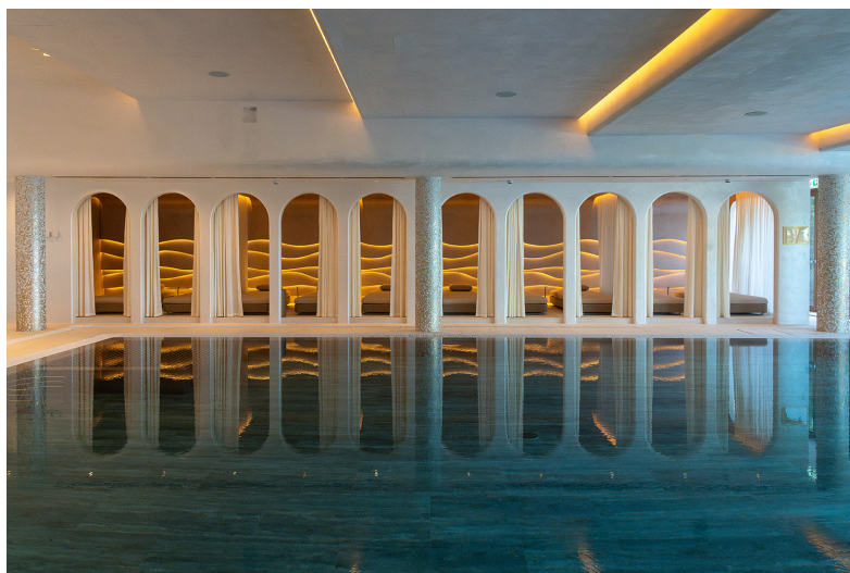
RAKxa Spa, Castelfalfi in Montañione, Italy. 10. RAKxa Spa, Castelfalfi | Montañione, Italy

Among the splendor of Tuscany's vineyards, a groundbreaking wellness synergy has taken root at Castelfalfi resort's RAKxa Spa. Marking the Thai brand's European debut, RAKxa was unveiled in March 2024 as part of a multi-million-dollar renovation by Affine Design. The French design team skillfully intertwined ancient healing traditions with contemporary comforts, creating a sanctuary of earthy tones, natural materials, and seven treatment rooms. The spa also boasts saunas, steam rooms, and a stunning heated infinity pool that offers breathtaking views of the Tuscan landscape. In partnership with legacy brands like ESPA and Maria Galland Paris, the RAKxa experience introduces exclusive integrative rituals rooted in Thai, Chinese, Ayurvedic and energy healing philosophies.