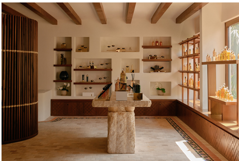
Maroma Spa By Guerlain, Maroma, A Belmond Hotel in Riviera Maya, Mexico.