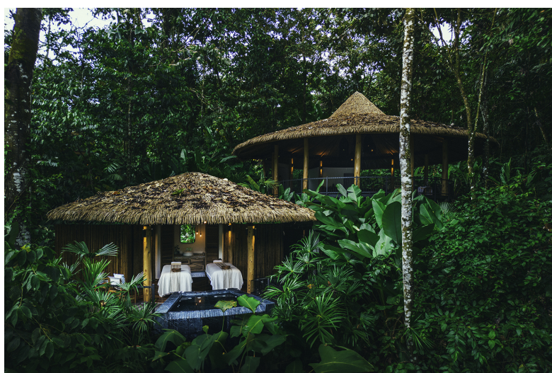
Nayara Tented Camp in La Fortuna, Costa Rica.

A daring avant-garde realm defying the limits of age itself, the Longevity Spa is the pièce de résistance of Portrait Milano. Enconced within architect Michele De Lucchi's meticulous restoration of a 1564 Archiepiscopal Seminary, this 7,500-square-foot domain alchemizes the building's Renaissance Revival soul with pioneering biohacking science. The design brilliantly merges past and future: beneath the seminary's towering vaulted ceilings, an atmosphere of tranquility reigns, with a showstopping pool and wet areas setting the tone for optimized rejuvenation through bespoke high-tech regimens. The Ferragamo family and their Longevity Suite collaborators have manifested a future-forward space that metabolizes cutting-edge technologies, regimens inspired by the world's Blue Zones, and a holistic philosophy of prospering through science-infused natural balance.