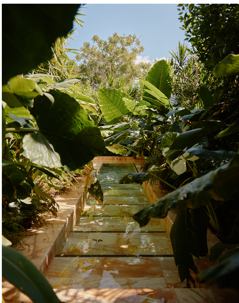
The Garden Club at Palm Heights in Grand Cayman.

Patricia Urquiola has masterfully reimagined Rome's Renaissance-era Palazzo Salviati Cesi Mellini as the Six Senses Rome. At the heart of the hotel's wellness ethos is the Six Senses Spa, where Urquiola has orchestrated a luxurious bathhouse revival that pays homage to ancient Roman indulgence. Spherical artistry nods to the palazzo's heritage, while handcrafted travertine and cocciopesto plaster surfaces channel the esteemed Vitruvian design principles. The highlight? A thermal masterpiece featuring a travertine-clad caldarium, tepidarium, and frigidarium circuit—with walls adorned with a bas-relief of Daphne's laurel tree—complemented by a hammam, sauna, and tranquil sanctuaries, and meditation nooks.